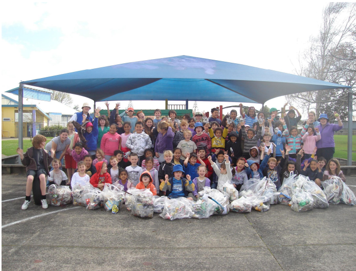
Children from Peninsula Primary making a difference in our community. Look at all the rubbish we collected!

In other news, every year Keep Waitakere Beautiful Trust arranges for Waitakere residents to clear rubbish from streets, parks, beaches and reserves this is called Operation Spring Clean. We have participated in this clean up at our school for the past few years. This year for the first time we took our Operation Spring Clean outside the school to the local community. We picked up heaps of rubbish and the students were surprised to find as much rubbish as we did! We are all happy that the litter we collected will not end up polluting the sea and waterways. A big thank you to all the parent helpers, we could not have done this without you!